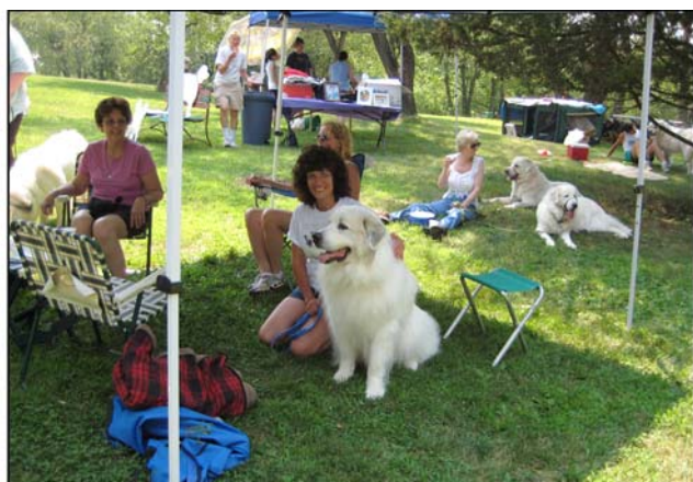
Pyrenean Fun Day, 2008 at Gress Mountain Ranch provided lots of fun, food & fellowship for Pys and people.