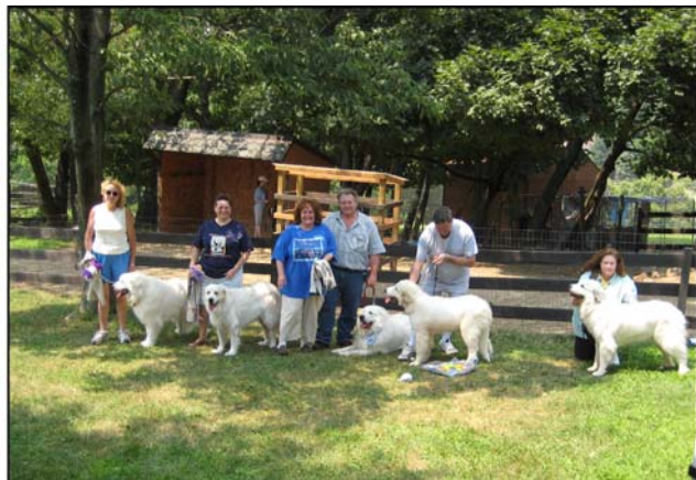
Fun Match winners.