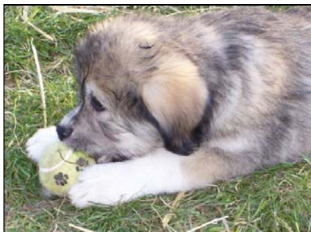
Teddy Choffel, 2006 – 2008

The Choffel household is in mourning for their Pyr-Son, the curly-haired, sandy-colored pup with the smiling Irish eyes who went loping to the Rainbow Bridge on Monday, June 16th. After the many times of following his brother lab, Marley, out the door, this time he gets to lead the way and find all the new smells and special doggie places on the other side.