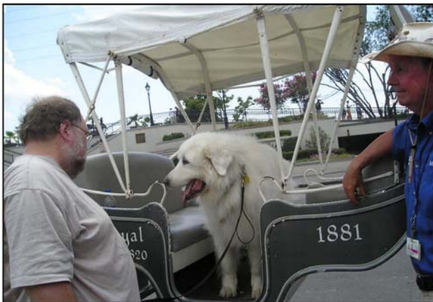
Mellow tours the streets of New Orleans in style!

In the early, cooler mornings we visited the street performers and artists at Jackson Square, the Saint Louis Cathedral, and walked along the banks of the Mississippi where the Riverboat Natchez is docked. Then we took Mellow to sample a beignet, a heavenly powdered sugar covered pastry typically eaten with chicory coffee at the famous Café Du Monde. We gathered quite a crowd under the green and white awnings as we sat to delight in